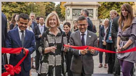
President of the Regional Council of Piedmont M. Laus, German Federal Research Minister J. Wanka, EU-Commissioner for Research, Science and Innovation C. Moedas cutting the red ribbon at the opening ceremony (f.l.t.r.)

Marine litter as a global challenge was first tackled at the high-level G7 summit 2015 in Germany. The Federal Ministry of Education and Science (BMBF) promoted this topic e.g. via the brochure "The Future of the Oceans – Joint research for a healthy marine environment". A "G7 Action Plan to Combat Marine Litter" was set up as an Annex to the Leaders' Declaration of G7 2015.