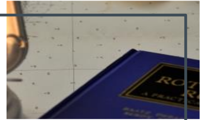
Society & Governance