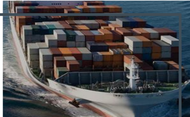
Trade & Transport