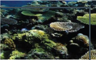
Climate & Environment