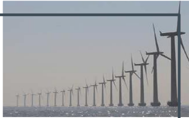
Energy & Resources